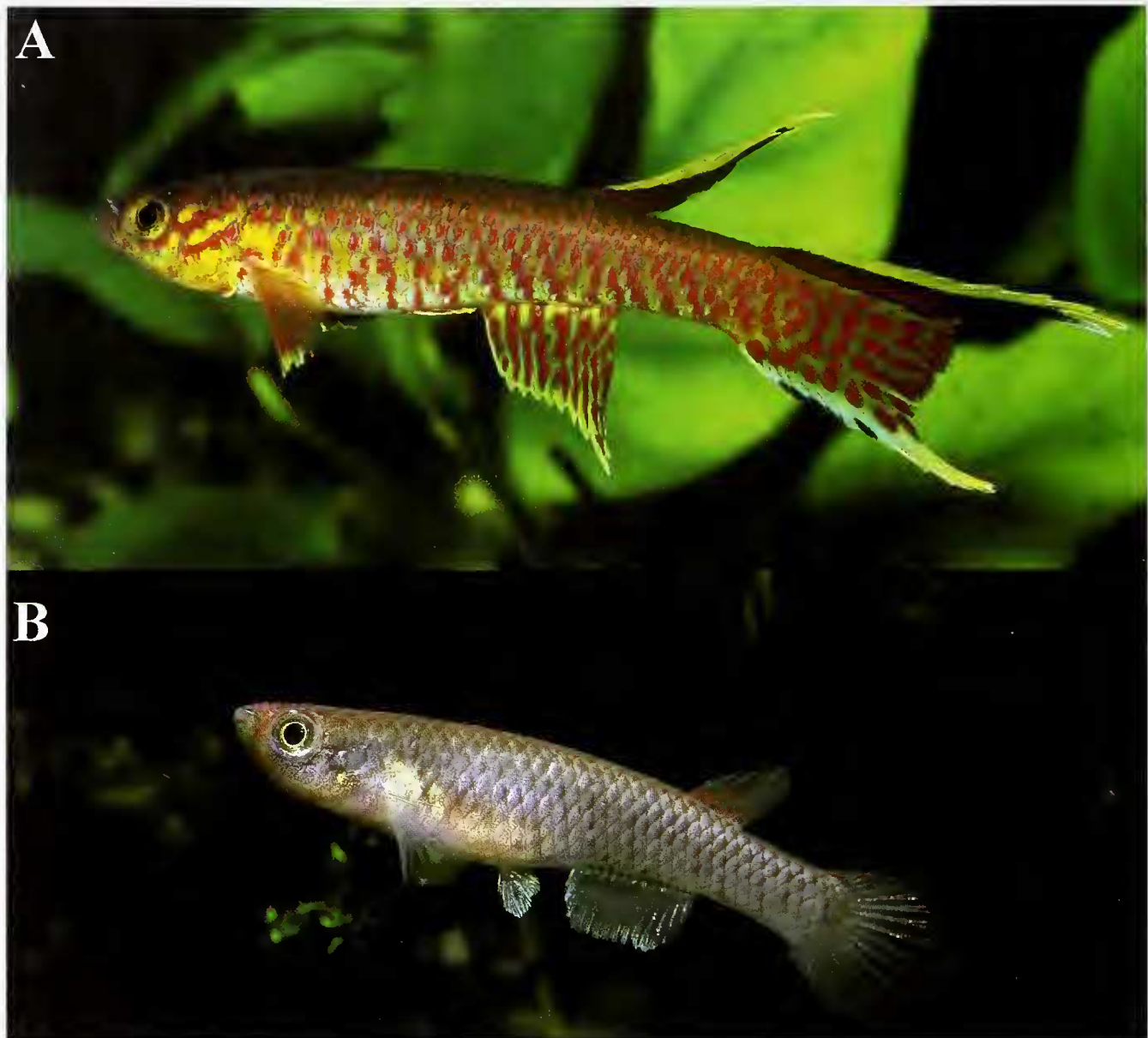
Fig. 2. A) Male of Aphyosemion pseudoelegans , collected at Boende in May 2002, not preserved. Digital copy of a colour slide. B) Female of Aphyosemion pseudoelegans , collected at Boende in May 2002, not preserved. Photographed by H. Ott three months after collection.

Holotype. MRAC 178016, male, 33.3 mm SL, Democratic Republic of Congo, Équateur Province, Tshuapa Basin, Boende, 0°14'S, 20°50'E, coll. P. Brichard, 1969.